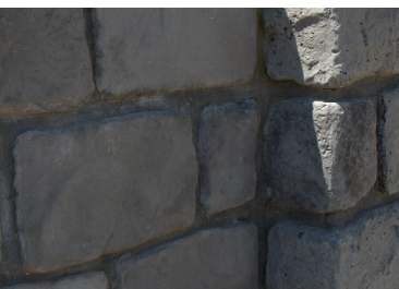
Bluestone Pitchers (also in Sandstone)