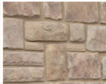
Sandstone Mix (also in Bluestone)